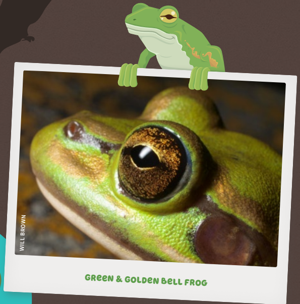
GREEN & GOLDEN BELL FROG

Just so you know: humans can't get warts from touching frogs because human warts are different to the warts you may see on a frog. In saying that, it's best not to touch them as they are delicate and our hands carry germs that could hurt them.